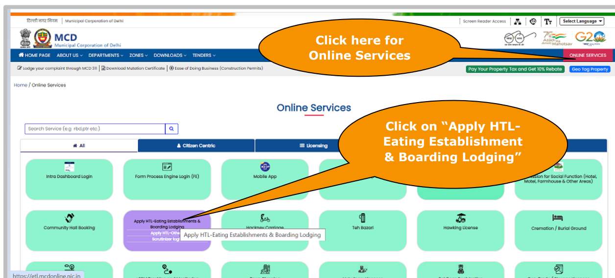
Fig.-1.1-New User Registration

You can access online application of HTL by typing https://mcdonline.nic.in the address bar of the internet browser, and then select "Online Service" on the Home Page and select "Apply HTL-Eating Establishment & Boarding Lodging".